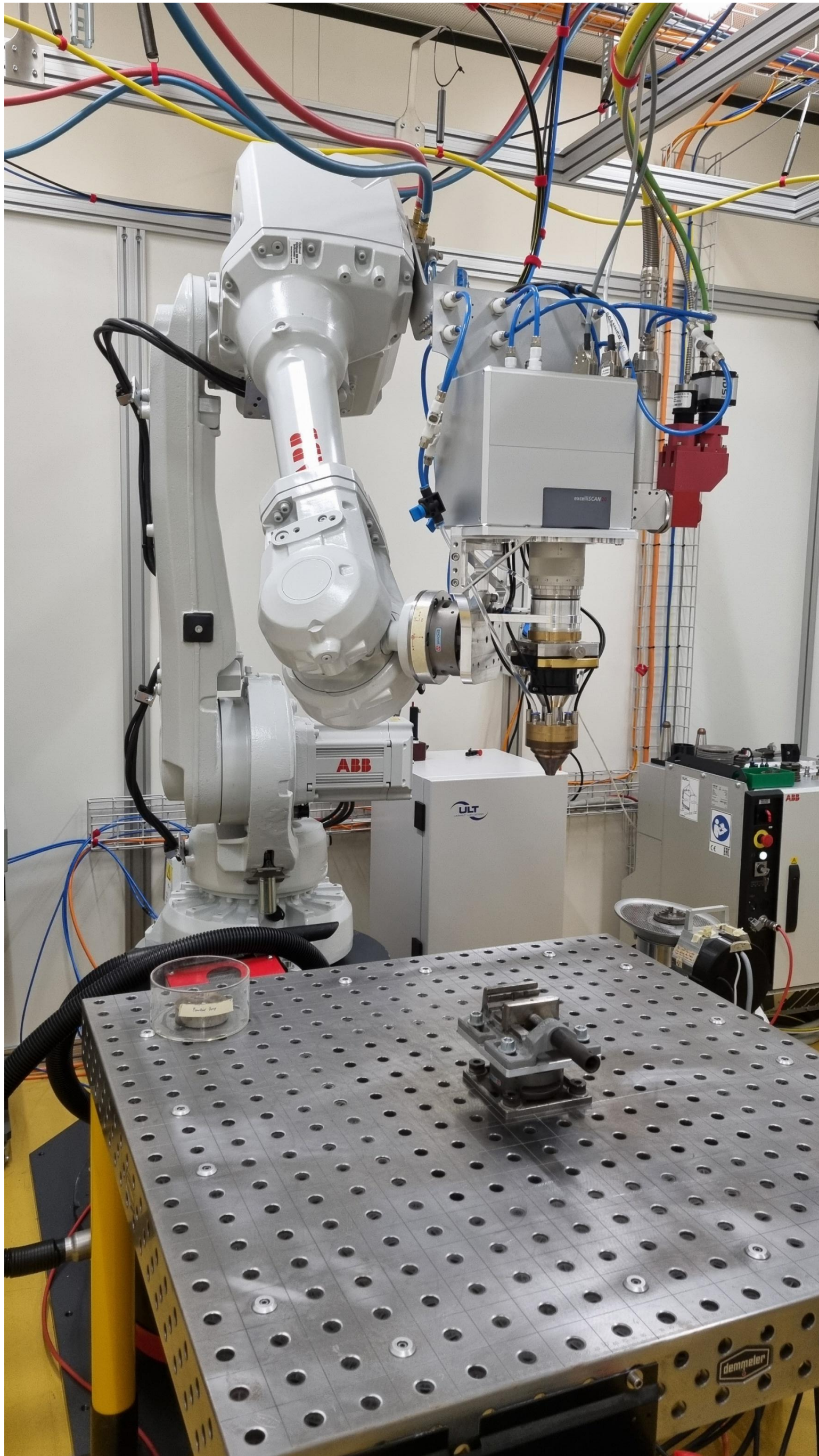
Prototype laser facility at FHNW Windisch Switzerland