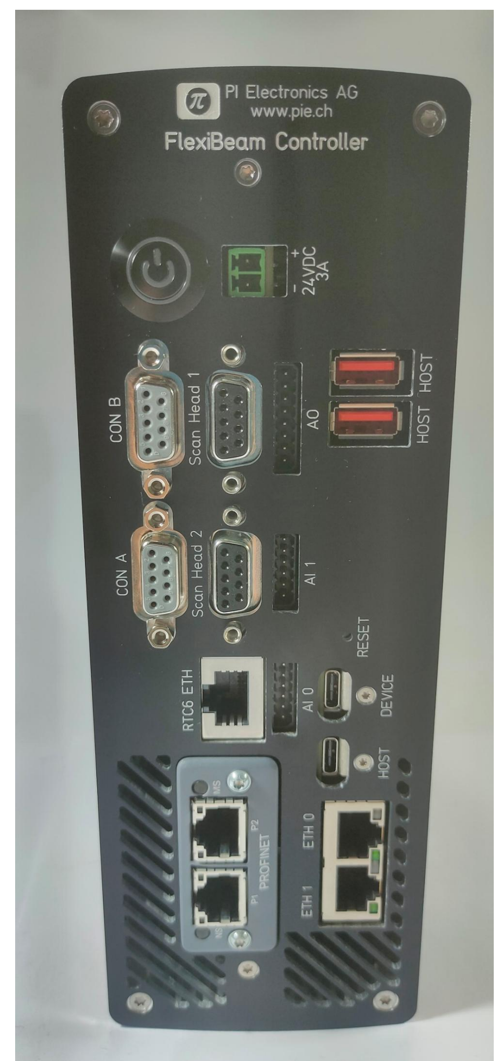
FlexiBeam controller, developed and built by PI Electronics AG www.pie.ch